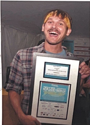
Catawba Brewpub received a 3rd Place award in the Best Beer category.