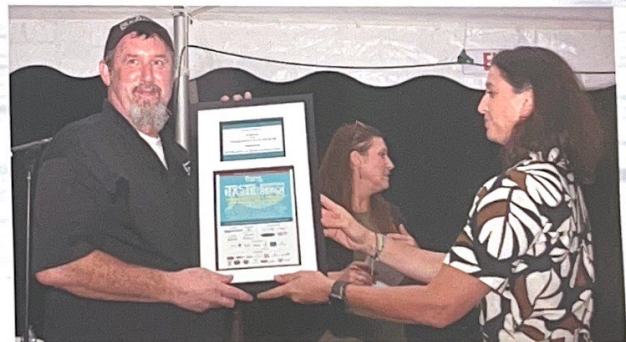
The Bluewater Grill placed 2nd with the People's Choice award for its grilled oysters topped with pimento cheese and a bacon crumble.