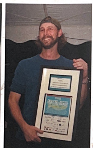
Nothing Bundt Cake wins 3rd Place for "Best Sweet Dish."